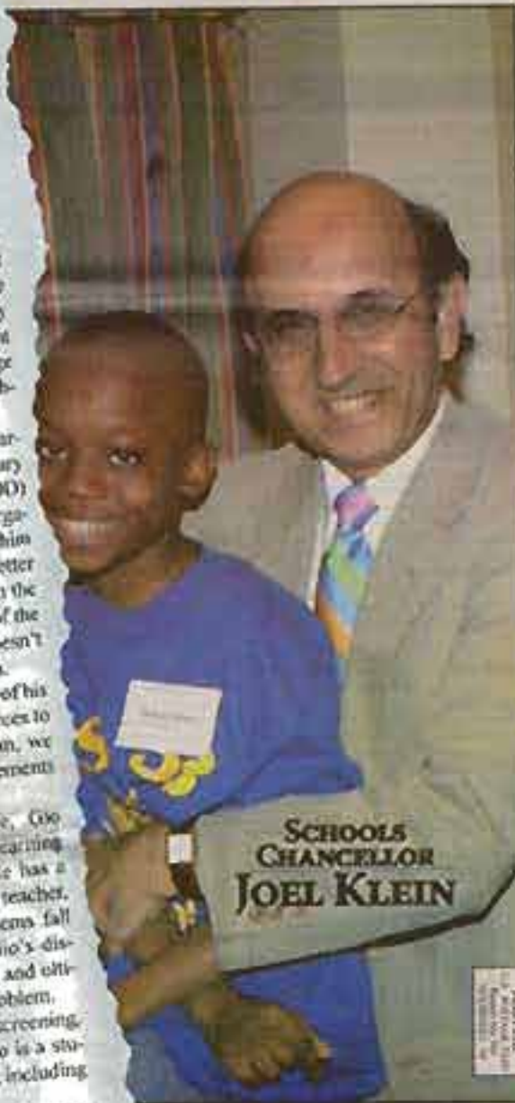
SCHOOLS CHANCELLOR JOEL KLEIN